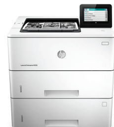
HP LaserJet Enterprise M506x